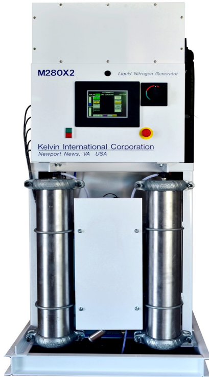
M280X2 industrial model without enclosure